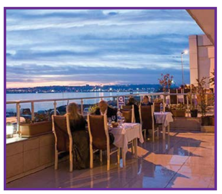
» Florya Coast Tour and Evening Dinner Alarga Restaurant

Since 1995, Alarga Fish Restaurant has served the finest fishes of its kind. It is located right next to the Marmara sea, guests can enjoy fine cuisine with a spectacular view.