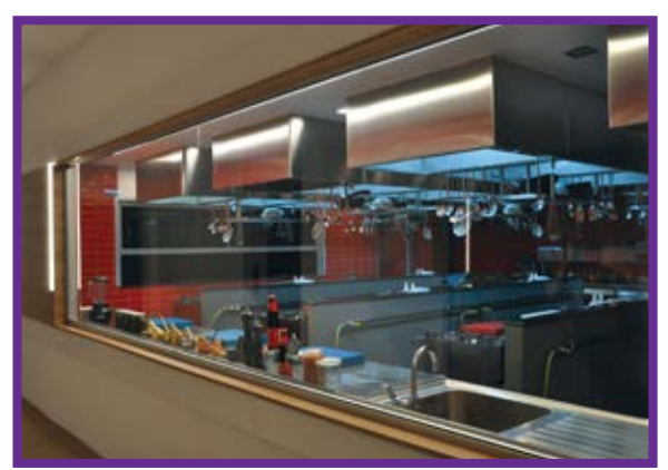
Course Name: Gastronomy, Food and Culture 3 ECTS