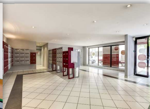
Entrance Résidence Nexity Riquier